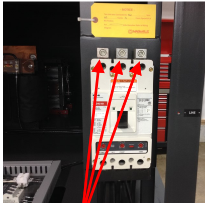
Incoming Power Connections

Right Side of Unit: (looking from the front)