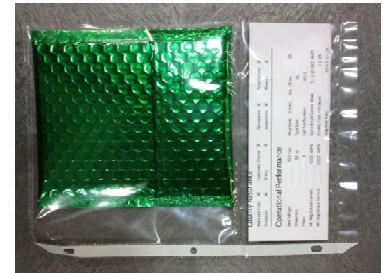
Operating Manual and Drawings

The manual is shipped with the unit in electronic format wrapped in a green bubble wrap mailer within the Accessories Box. In the manual is an extensive step by step process of how to assemble the enclosure and attach it to the unit.