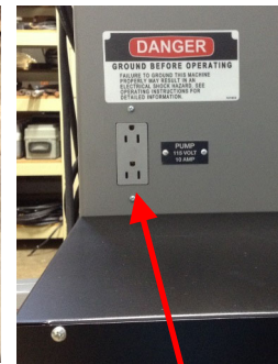
120VAC receptacle for pump