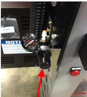
Air Pressure Regulator