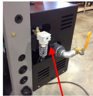
Incoming Air Connection 1/8" NPT Thread